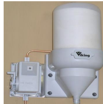
VOA VB/TMWB V89